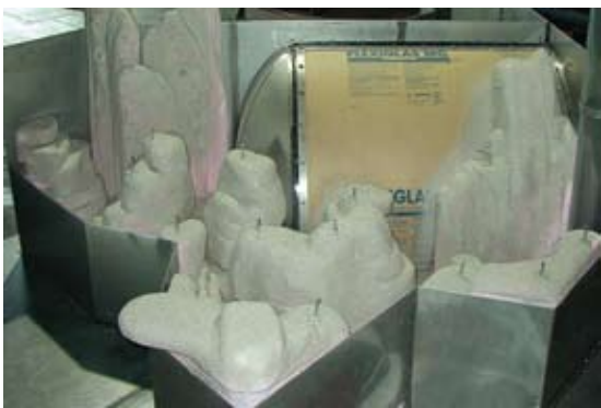
Exhibit design is as much about creating authentic surroundings as the species being displayed. Beyond the aesthetic effect of realistic side to side movement of kelp strands, live coral requires water flow to transport nutrients while carrying waste away. Wave generation performs a vital life support function as well.