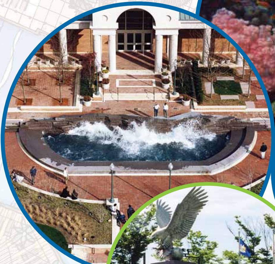
NOAA Headquarters, Washington DC – (National Oceanographic Atmospheric Administration). Fountain utilizes WaveTek system that simulates a natural, rocky seashore.