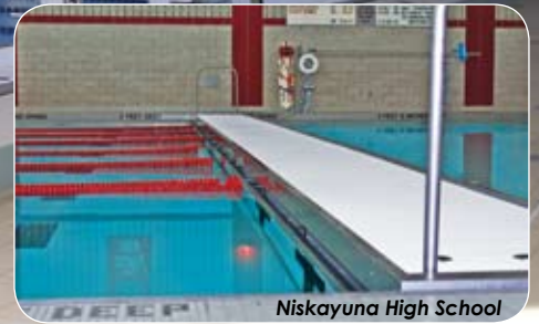
Niskayuna High School

A pool divider, or bulkhead, must be compatible in size, profile and performance with the pool, its potential users, and the intended programs of the aquatic facility. It must meet the requirements of health and safety codes, along with the facility's curriculum such as: competitive swimming, diving, polo, recreation, fitness, training or therapy.