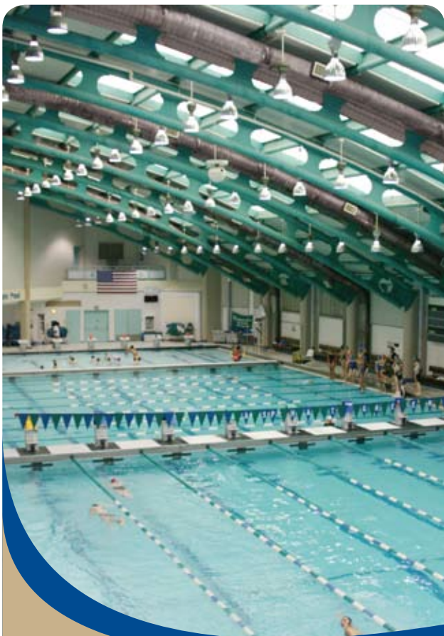
Asphalt Green Center