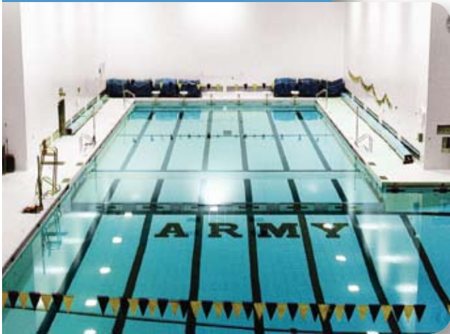
West Point Military Academy